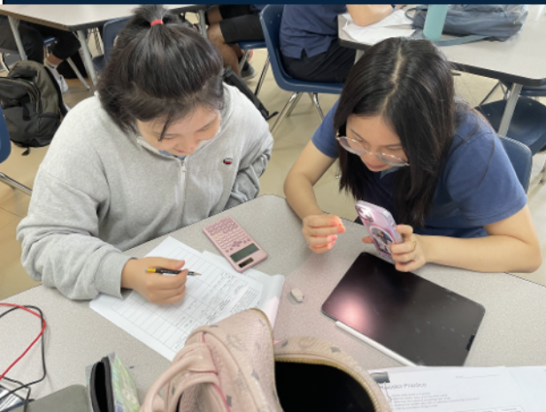
Engineering Foundations students used color bands and multimeters to determine the level of resistance of these resistors.