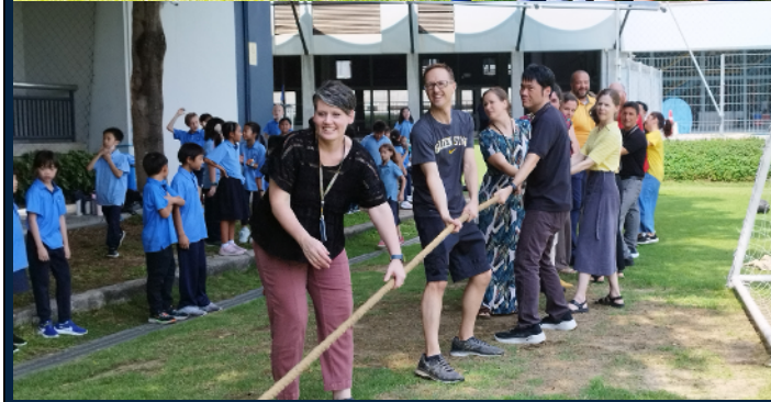
Grade 3 students competed against a group of teachers and staff in a tug of war this week to finish off their science unit on forces! The students proved to have too much force for the teachers and staff!