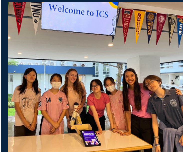
The ICS Fifty Squared Club hosted a fundraiser for International Women's Day this week!