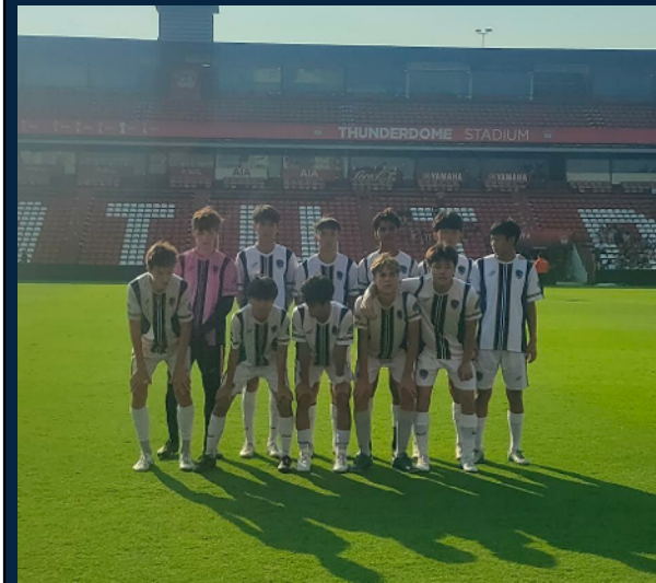
Our varsity boys soccer team recently played a game at Thunderdome Stadium!