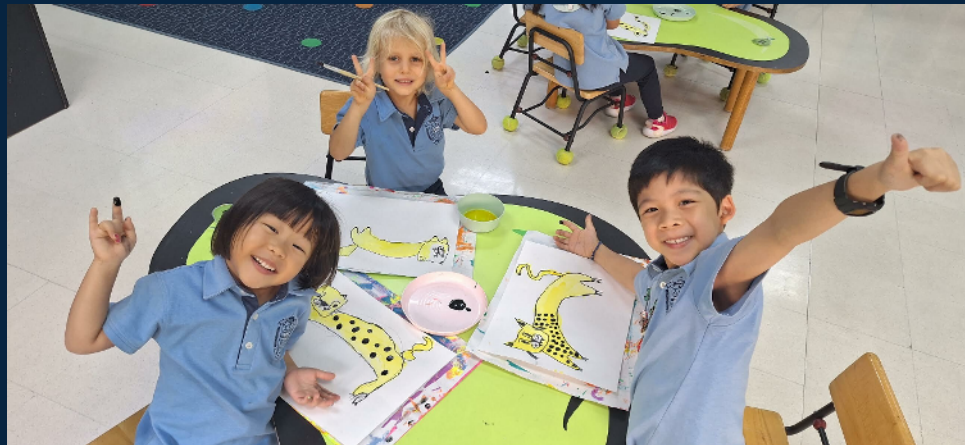
Our K4 students have been learning about wild animals in art. They've learned about cheetahs spots being unique like human fingerprints and they used their fingerprints to paint on the spots on their cheetah paintings!