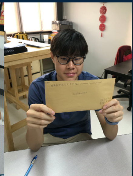
Mandarin 2 students are pen pals with students from SPH- Lippo Village where they work on developing their reading and writing skills in Mandarin.