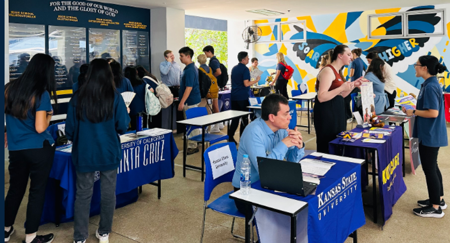
This week was the annual College Week for our HS students with seminars for parents and students on the college admissions process and a university rep fair!