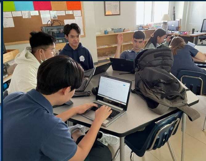
Our HS Engineering Design students leveraging ChatGPT to write computer codes connected to spreadsheets and how to understand each line of code! Amazing!