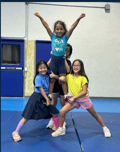
The ES Cheerleading enrichment students are quickly progressing with their impressive skills!