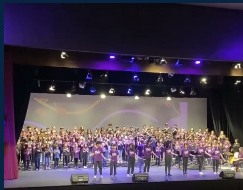
ICS Grade 5 and MS Choir students participated in the Young Voices Choral Festival this week with an amazing performance collaborating with 2 other schools.