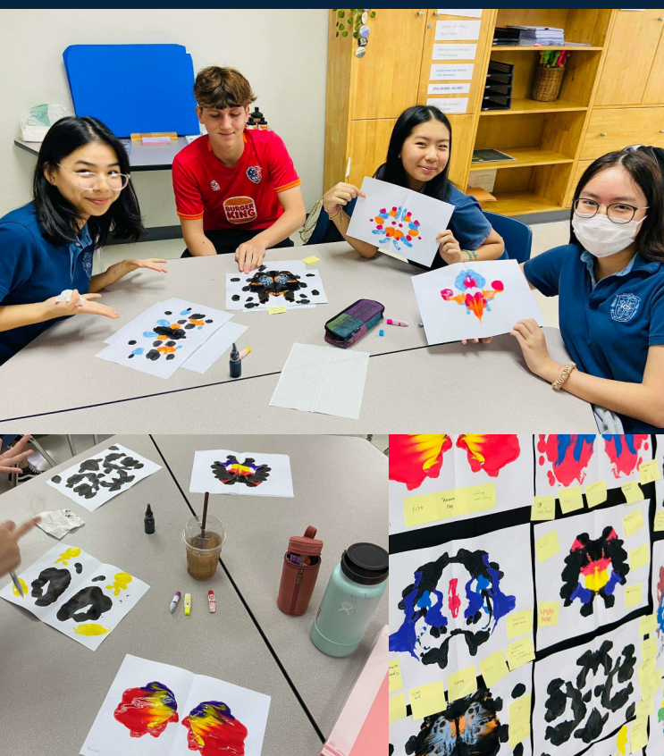
AP Psychology students learned about the validity and reliability of Rorschach Inkblots in Psychotherapy Diagnostics.