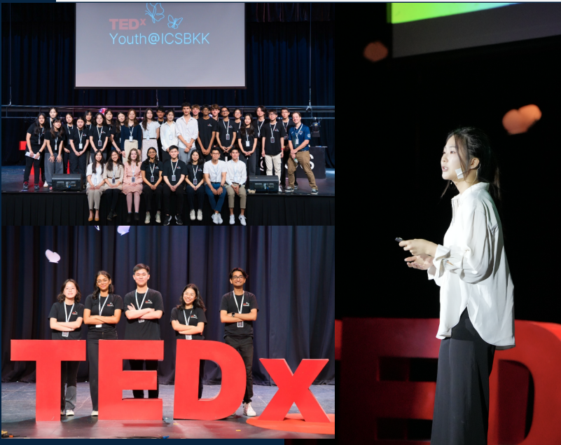
The TEDx Youth@ICS event was a huge success! Congrats to the student organizers and speakers.