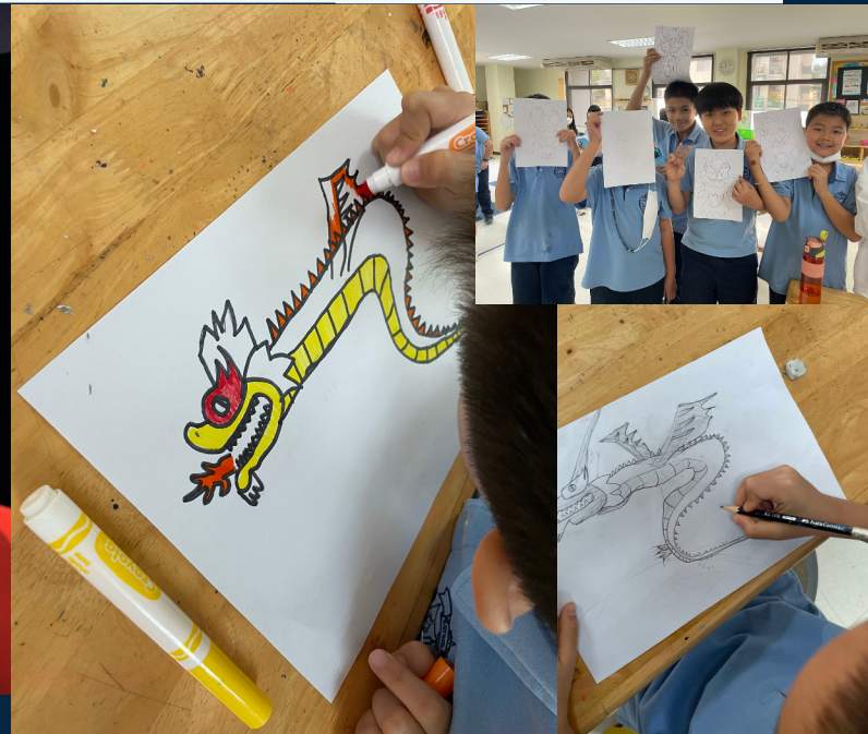
Grade 2 and Grade 5 students worked on dragons in celebration of the Lunar New Year!