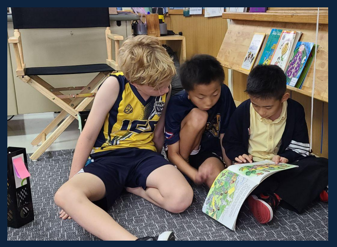
On Thursdays, our 2nd and 5th grade students meet up for "Buddy Reading" time!

<u>September 7</u>- Annual Writing Assessment <u>September 15- 17</u>- ServICE Conference