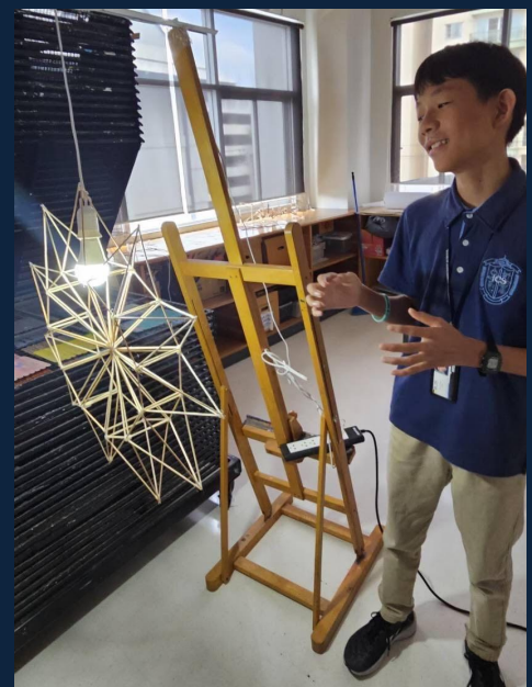
MS 3D Art students explored rhythm and repetition in class this week! s