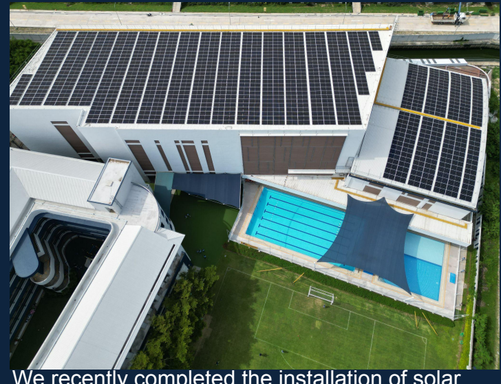
We recently completed the installation of solar panels on the ARC helping to reduce our impact on the environment!