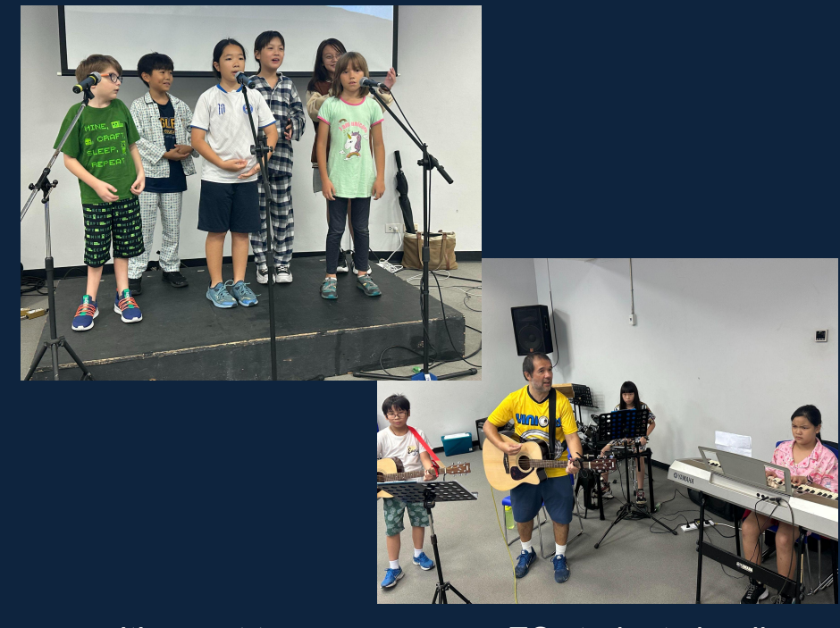
It's great to see our upper ES students leading during ES Chapel!