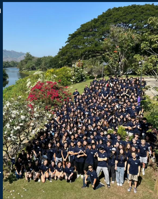
Our HS Eagles Camp in Kanchanaburi last week was amazing! What a beautiful group photo on the last day!