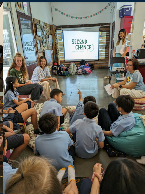
This week, grade 4 classes went to Second Chance Bangkok to learn about creating new items from recycled materials and they learned about the challenging life experiences facing people in Bangkok.