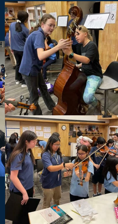
Our Strings & Band teachers and students hosted a "Try It" session for the grade 5 students as they think about what classes to take in MS!