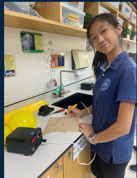
A new round of MS X-blocks started up this week. Wood burning pictured here!