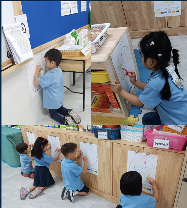
In Thai class, K4 students learned about colors. They chose crayons to match the colors they heard and created vibrant shapes in that color. FUN!