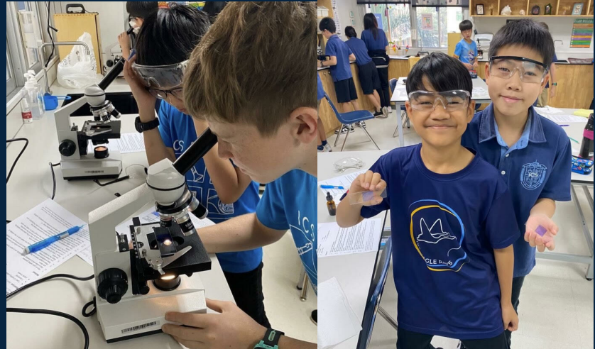
Grade 6 students honed their science lab skills this week!