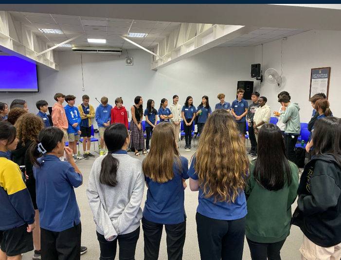
The HS counseling team organized a "Not So New" student lunch this week as a support and check-in for students in their first year at ICS!