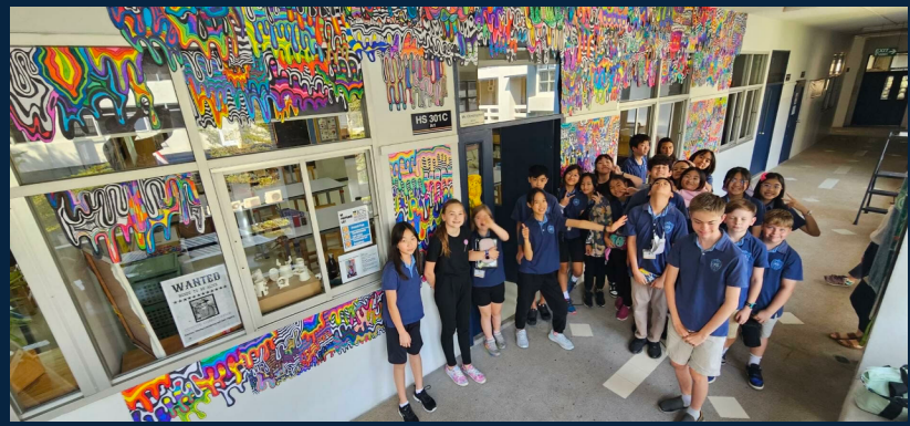
MS Art classes created a new art installation outside of the classroom. It looks amazing!

February 2- HS Night of Prayer & Worship