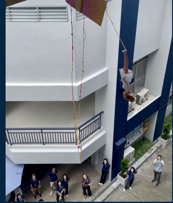
HS Statistics students conducted a "Barbie Bungee Jump" experiment to measure how many rubber bands give the best result.

This week, our MS & HS Students participated in the annual Triple T week, where they learn about important topics relevant to teens such as mental health issues, dating, online safety, sex education and the dangers of pornography.