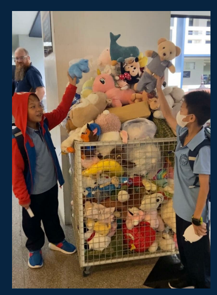
Grade 7 advisories are collecting new or gently used stuffed animals for donation to a community in need!