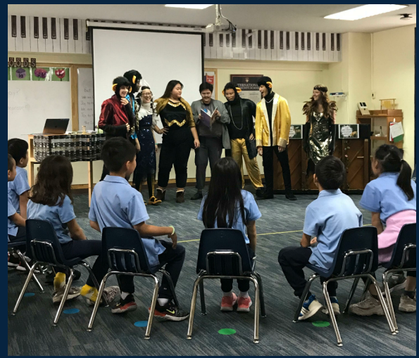
Cast members from Seussical visited our ES music classes this week!