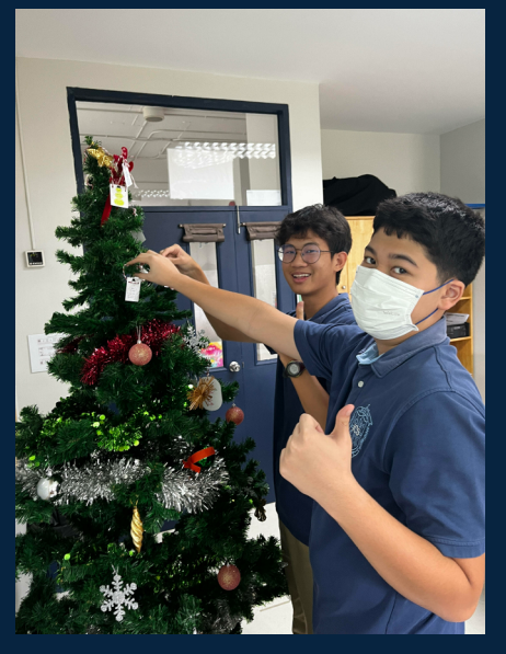
HS Algebra 2 students decorated their Christmas tree with polynomial end behavior snowman ornaments!