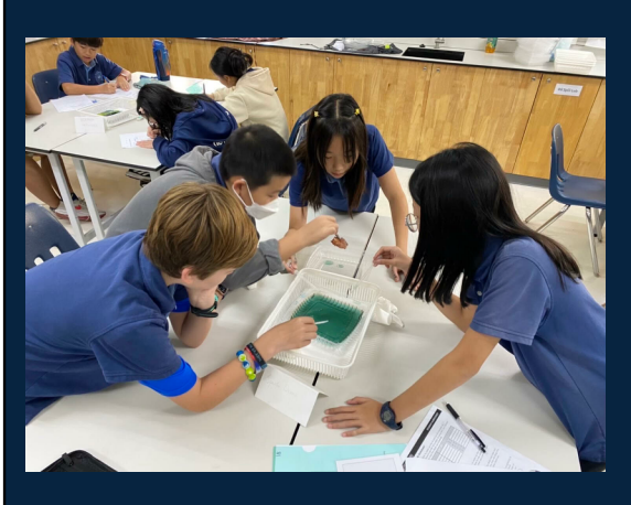
Grade 6 Science students learned about oceanic oil spills with a hands on lab activity this week!