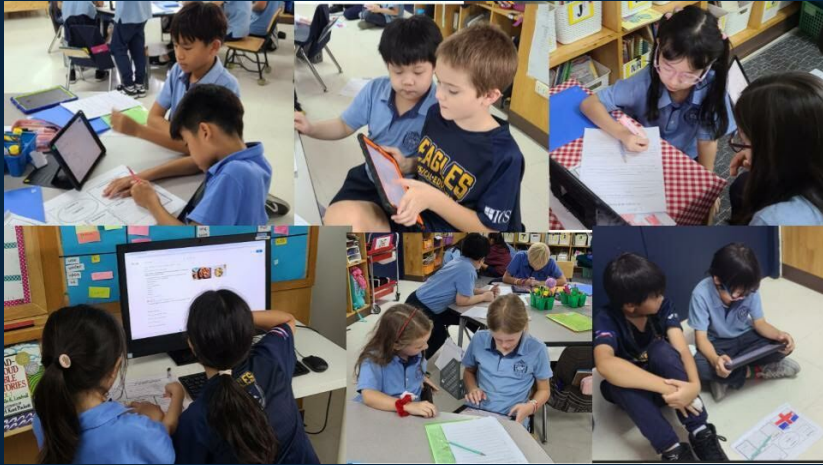
Grade 5 reading buddies helped grade 2 students with research for their country projects this week!