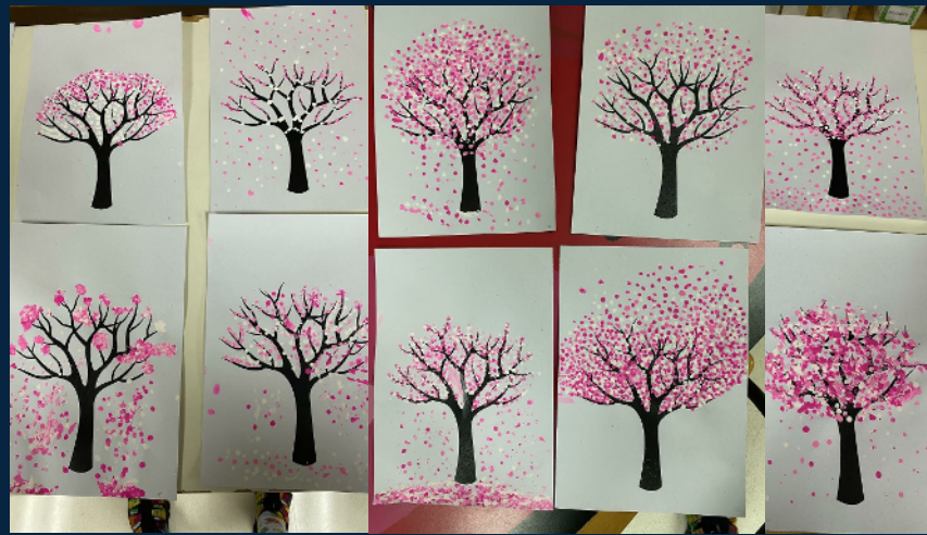
Grade 3 students made beautiful Sakura paintings as they learn about Japan.