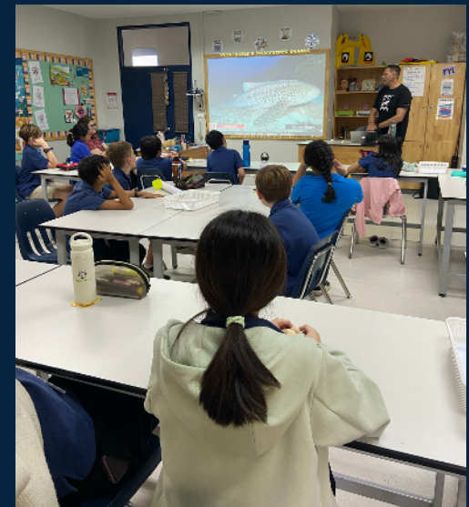
We were happy to have a representative from Shark Guardian come and share about sharks with our grade 6 Science students as well as the AP Environmental Science classes!