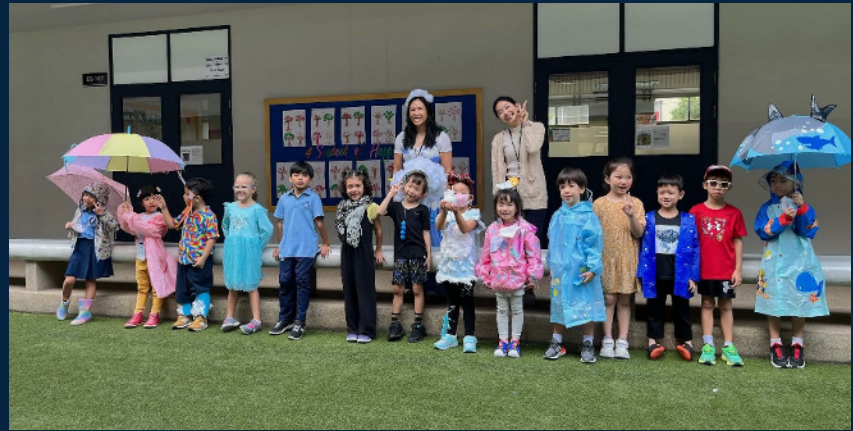
K5 Students dressed up for Weather Day for the end of their unit of learning about weather!