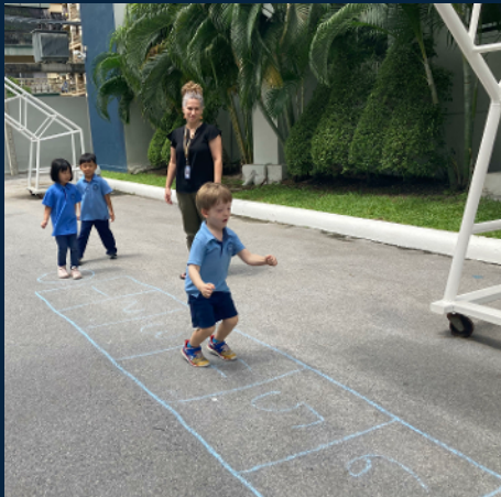
K4 students are learning about number lines. They practiced through active learning outside!