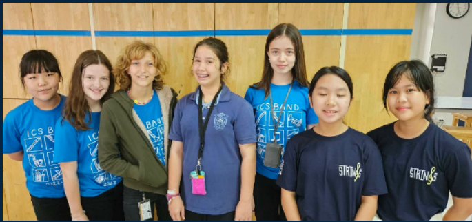
For the first time ever, ICS MS students were recently inducted into the National Junior Art Honors Society!