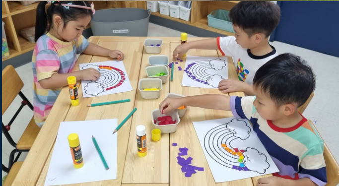
Our K4 classes celebrated Colors day this week!