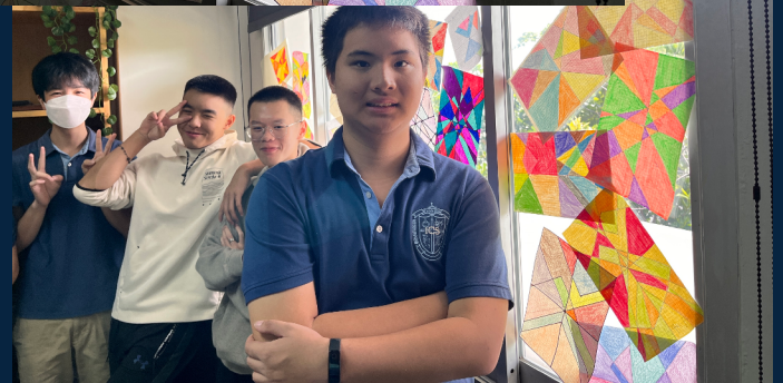
HS Algebra 2 students simulated stained glass window patterns by graphing absolute value equations.