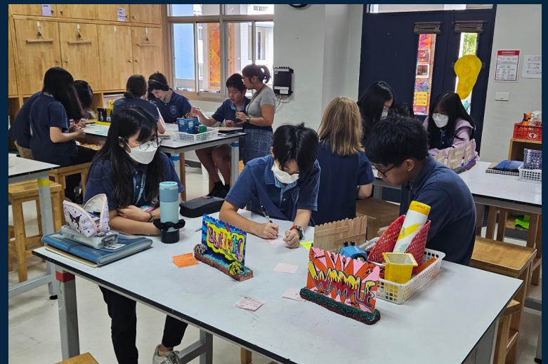
Grade 7 Art students completed a unit on Street Art and Graffiti and participated in a class critique.